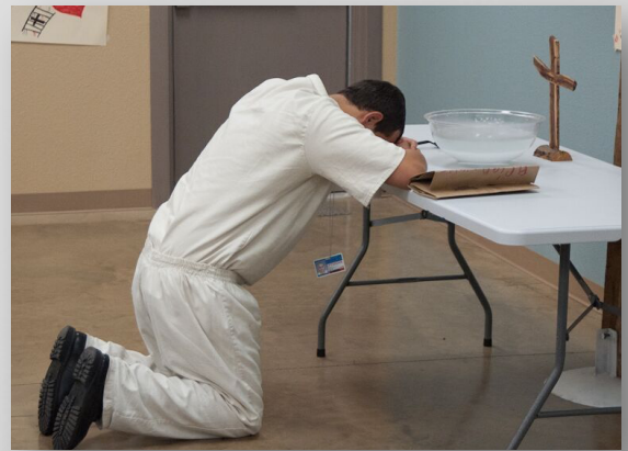
Prayers at Formby State Jail during the recent Jubilee Weekend.