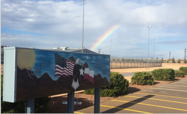
Rainbow over Sanchez State Jail during the Jubilee Weekend.